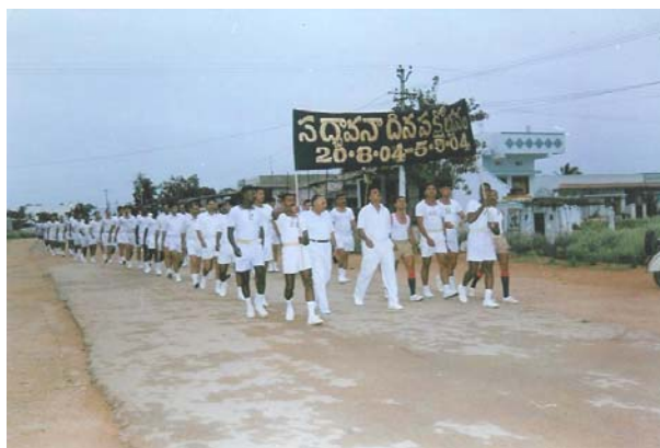
Sadbhavana Rally was organised at NISA on 21.08.2004