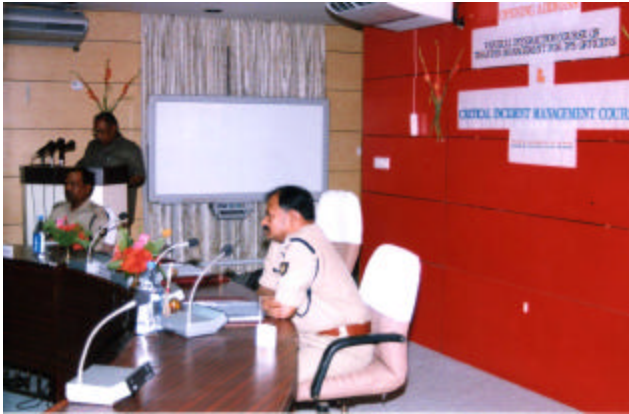
Inauguration of 4 th VIC on Disaster Management and 1 st Critical Incident Management Course