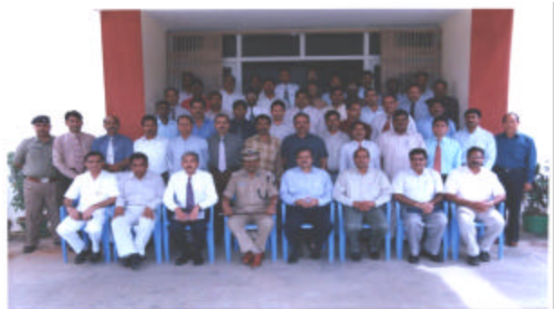
Participants of 1 st Critical Incident Management Course