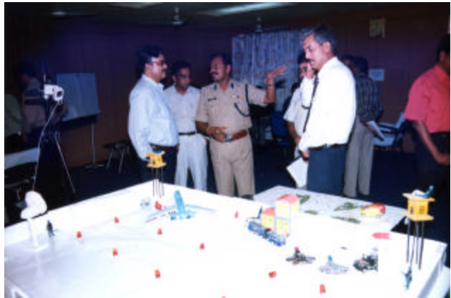
A simulation exercise of Hijack situation presented for CIM Course