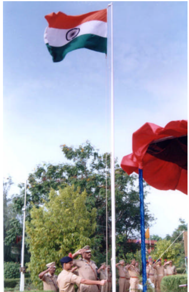
56th Independence Day celebrations

During the celebration of “Communal Harmony Fortnight” from 20.08.2002 to 05.09.2002, Sadbhavana Diwas was observed in the Academy in which all staff and trainees of NISA and FSTI had assembled at the NISA Parade Ground. The pledge was administered to all personell on 20.08.2002. A peace rally was organized on 24.08.2002 in which NISA Staff and trainees had participated. Various Programmes highlighting communal harmony were conducted throughout the fortnight.