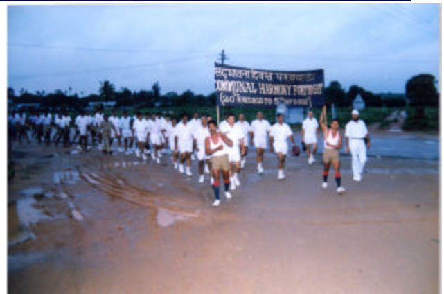
Sadbhavana Diwas – Peace Rally

Director/NISA gave away prizes to the winners and runners-up of Inter-Coy. Volleyball competition and also gave prizes to nine children who had participated in Drawing/Painting Competition held in NISA. Sweets were also distributed to all staff, children/family members and trainees after the above function.